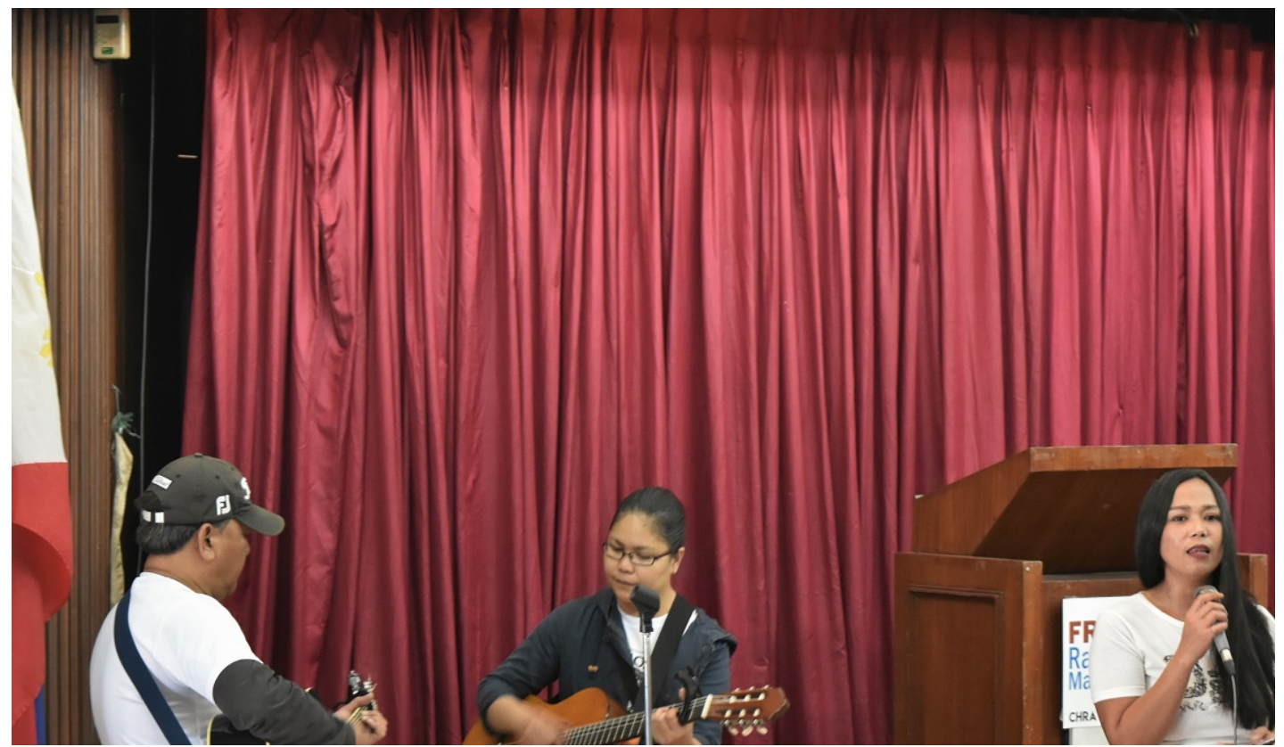
The majority of the lyrics by musical performers were political in nature.