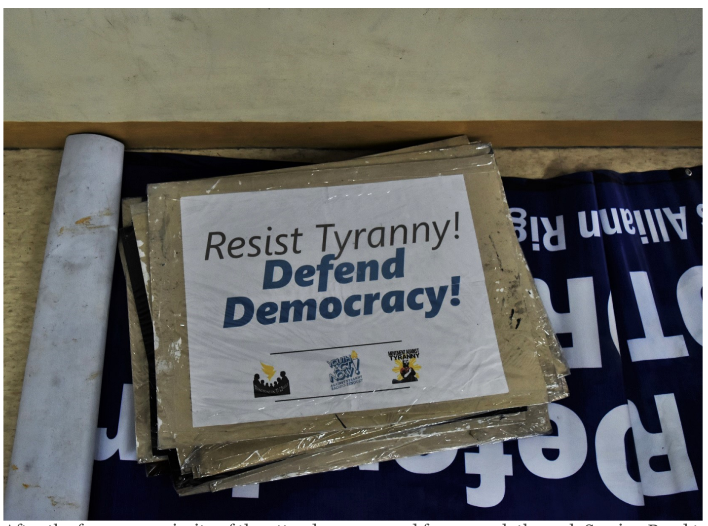
After the forum, a majority of the attendees prepared for a march through Session Road to Igorot Park.