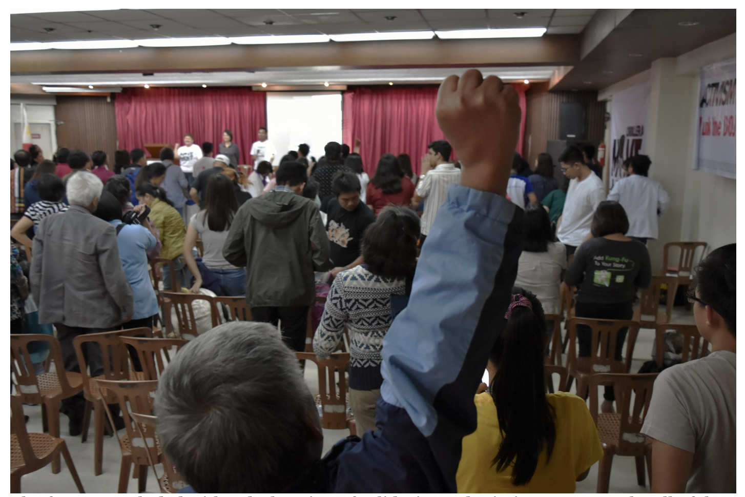
The forum concluded with a declaration of solidarity and mission statement by all of the attendees.